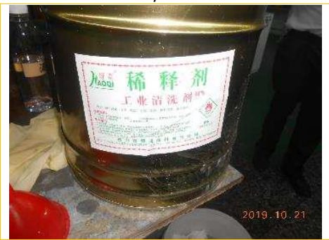
NC Cleaning Chemical was not marked with identification label