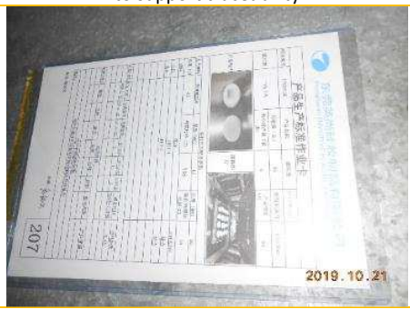
Parameter listed in the work instruction