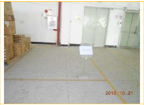
Non-conformance area for incoming materials