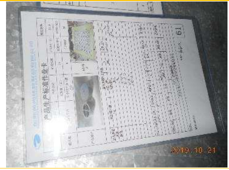
NC The up-to-date work instruction was not posted onsite timely, and version and established dated was not marked on work instruction.