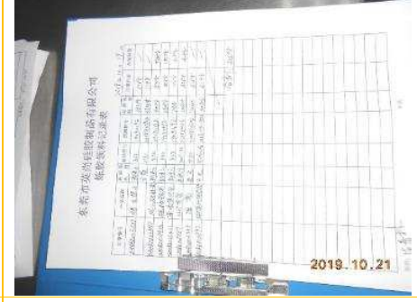
Silicone materials mixing records to support traceability