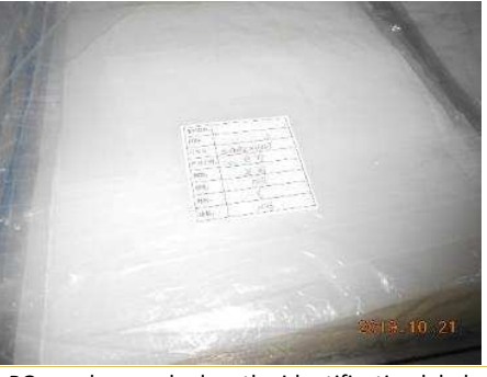
PO number marked on the identification label to support traceability