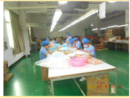
NC workers hair were not full contained in the cover at packing area