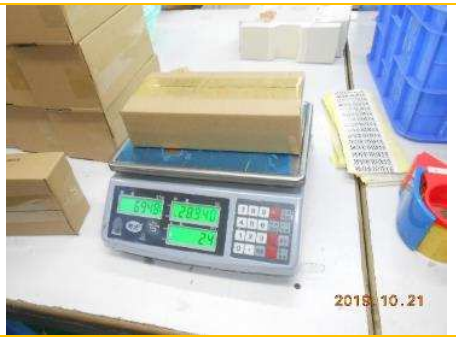
Weighting test on line for all packed product