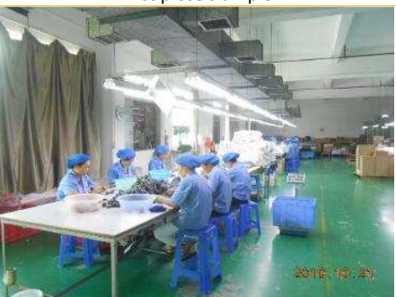
Silicone parts trimming and full checking station