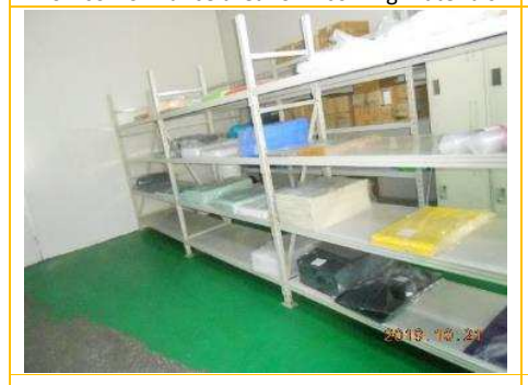
Semi-finishing product storage area