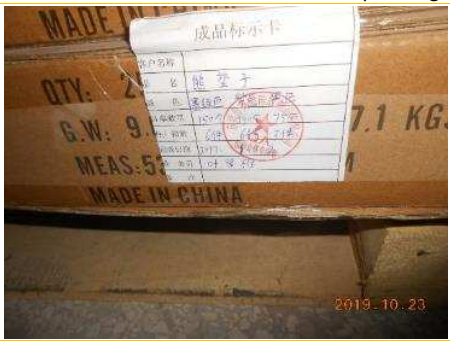
Finished product identification label