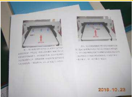
Work instruction for metal detection operating