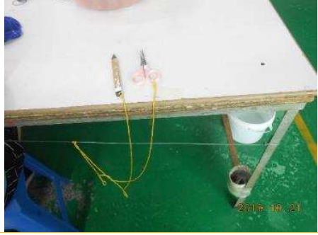
Sharp tool numbered and attached on worktable