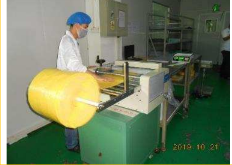
Silicone materials cutting