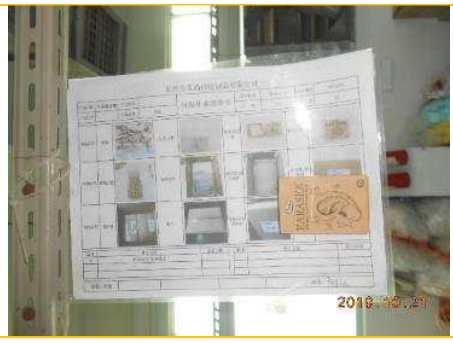
Work instruction and first piece sample