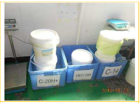
NC all chemicals were not marked with quality status