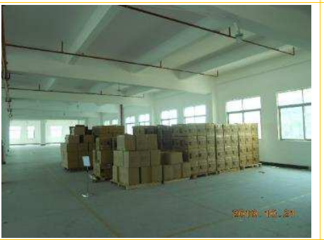
Finished product warehouse