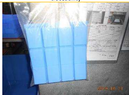
First piece s ample