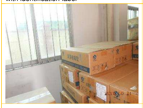
NC incoming silicone were store adjacent to un-shaded windows, with risk of exposed on sunlight directly.