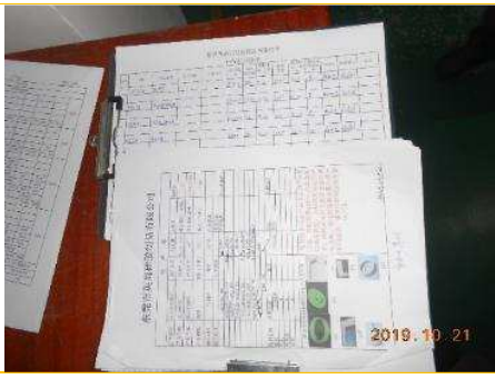
Vulcanization instruction and records