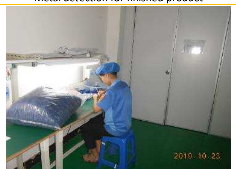
Finished product inspection station